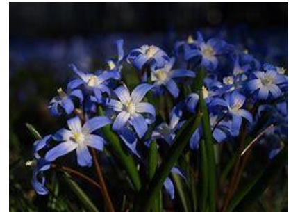
Glory of the Snow

3"-6" height, partial shade to full sun, upright form, white color