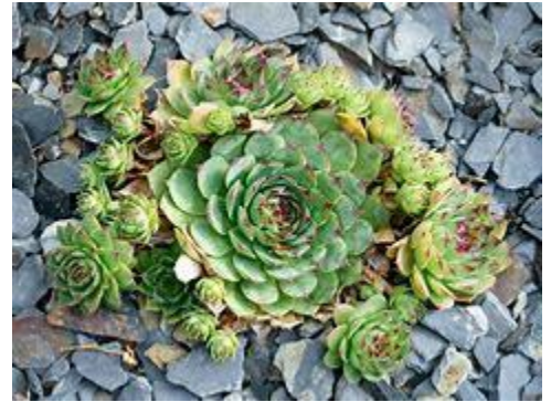
Hens and Chicks

6"-8" height, partial shade, low form, good for naturalizing/can spread aggressively