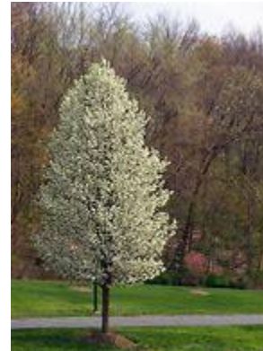
Pear Tree (Spring)

10'-20' height depending on variety, full sun, many varieties