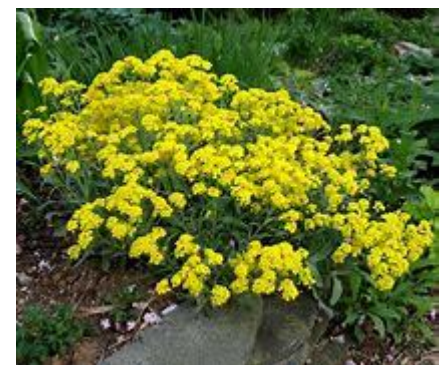
Basket of Gold