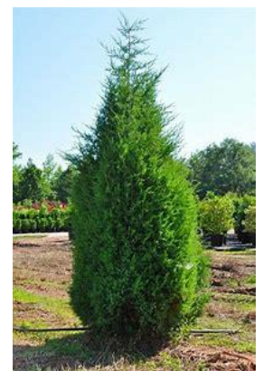
Eastern Red Cedar

45'-60' height, full sun, pyramidal form, yellow blooms/no change in fall