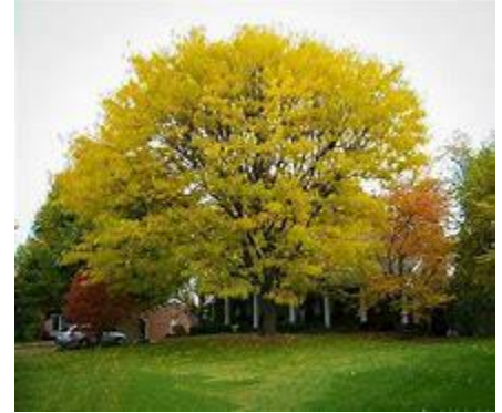
Thornless Honeylocust (Fall)