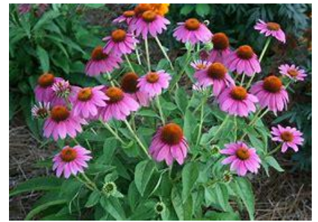
Purple Cone Flower

6"-12" height, partial shade to full sun, rounded form, works well as boarders